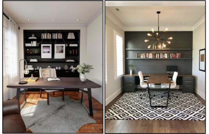
New Home Office Design Ideas

As we enter the new year, it is always motivating to make small changes in your life. Perhaps it is setting a goal of eating a healthy meal together with your family more often. Now may be the perfect time to change the color of your formal dining room that only gets used for special occasions. Commit to make every day a special occasion and maximize the potential of your home.